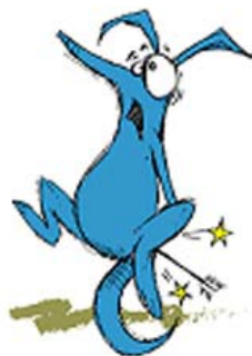
The effect was eye-popping.