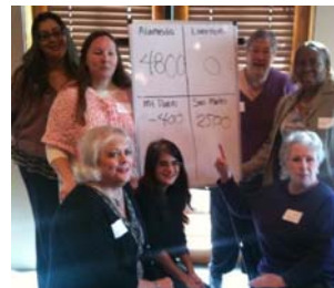
Alameda Co. Winners