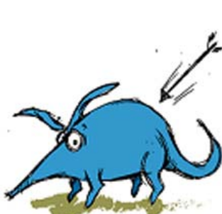
The arrow affected the aardvark.